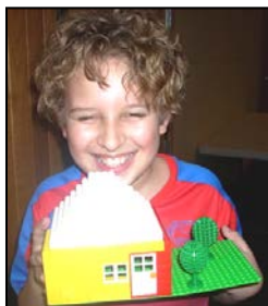
Lego Free Play