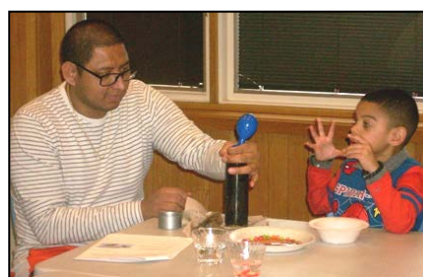
Kids Create Candy Science