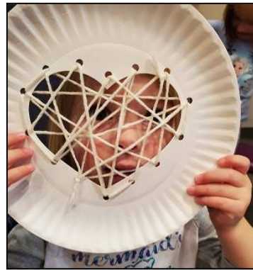
Preschool Story Time: Valentine's Day Weaving