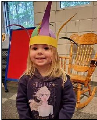
Preschool Story Time: Mardi Gras Hats