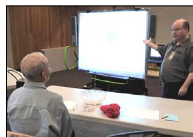
Black History Bingo