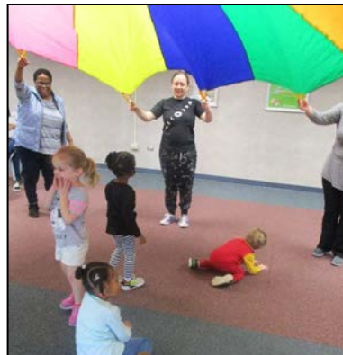
Musical Me: Music Around the World with the Fayetteville Symphony Orchestra