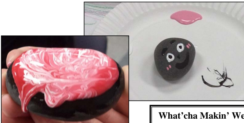
What'cha Makin' Wednesday: Rock Art Mandalas