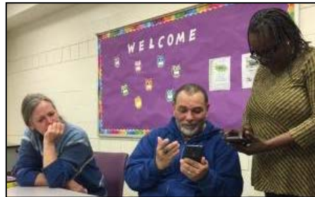
Senior Geek Squad