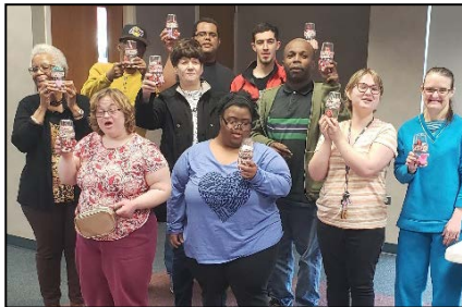
Crafts My Way