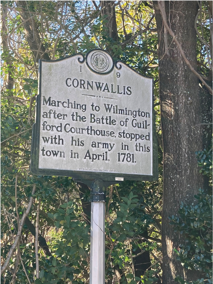
Cornwallis passed through Cross Creek after the Battle of Guilford Courthouse, where his forces pillaged residents' homes when passing through. This historic marker is on Green Street in what is now Fayetteville.