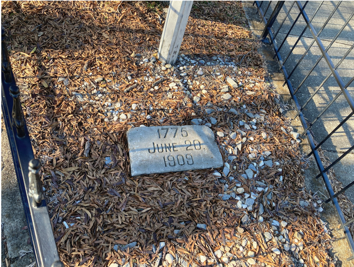
This marker was placed during the 1909 commemoration at Liberty Point.