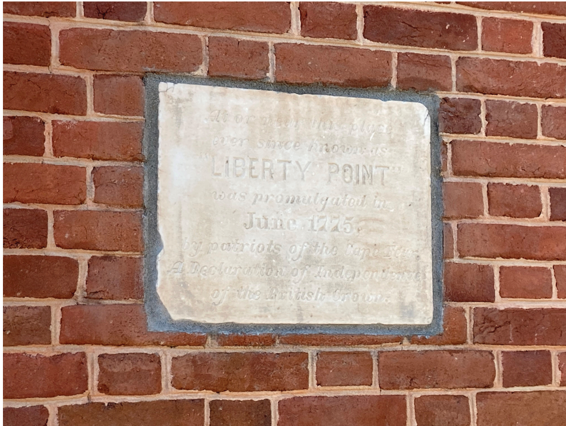
This marker commemorating the Resolves is on the side of the Liberty Point Building on Person Street. It was placed before 1909, but it is unclear the exact date.