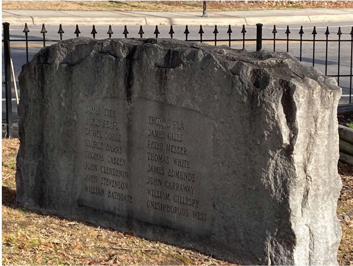
The backside of the Liberty Point Monument had the 16 forgotten signers' names added to it in Feb 1976, after the document was re-discovered.