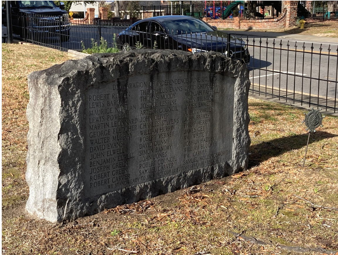
This monument was erected in 1933 on Person Street and listed only 39 signers. The other 16 had been forgotten about.