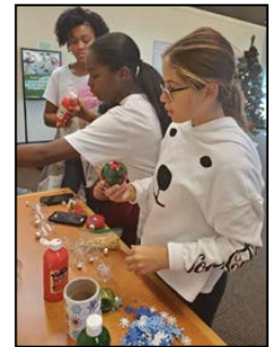
Teen Hang: DIY Ornaments