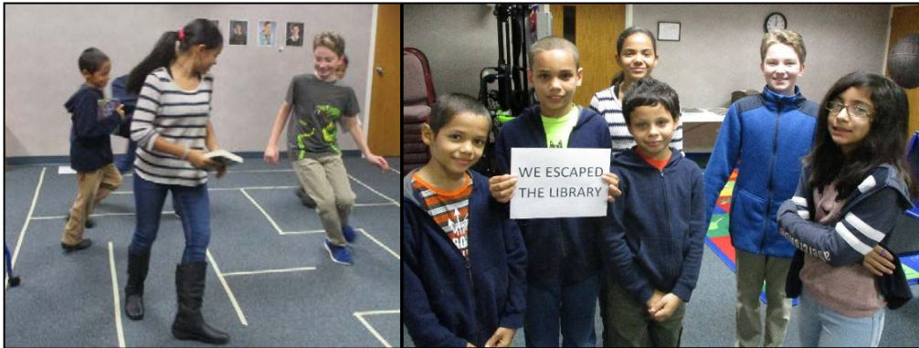
Teen Challenge: Escape Room