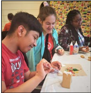
Teen Hang: Gingerbread House: Team work skill building