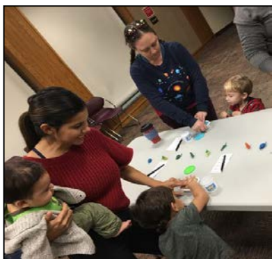
Fascinating STEM – Dinosaurs