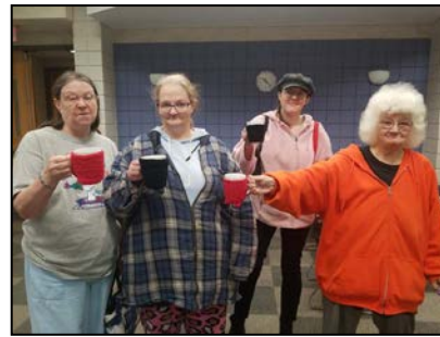
DIY Cozy Mug Sweater