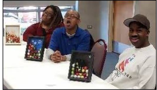
Crafting My Way: Disabled Adults Christmas Program