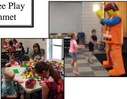
LEGO Free Play with Emmet