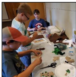
Making Groot felties at the teen lock-in: Mission Break Out