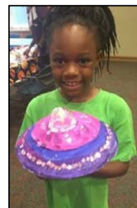
Kid's Create: Flying Saucers