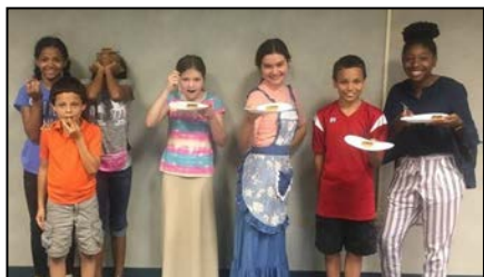
Teen Skills: Pecan Pie – participants show their baked mini pecan pies.